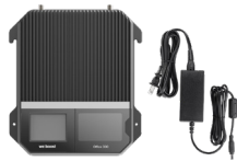
Office 300 Amplifier & Power Supply (850026)