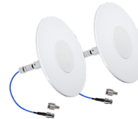
2+ Low Profile Antennas (314407) & 2+ N Male - F Female Connectors (971128)