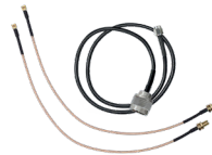
2 ft. SMA to N Male Cable, 1 ft. SMA to MMCX Cable & 1 ft. SMA to MCX Cable (295802, 953012, 953013)