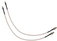
1 ft. SMA to MMCX Cable & 1 ft. SMA to MCX Cable (953012, 953013)