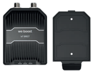
IoT Direct Amplifier & Wall Mount Bracket (460079)