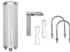
Omni Plus Antenna with Bracket & Hardware (314422)