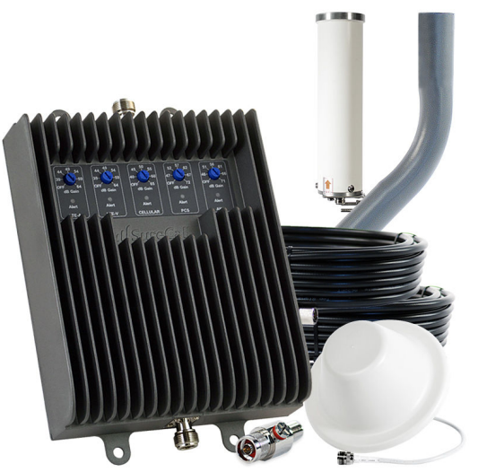
Shown: SureCall Fusion5s omni/dome kit from Powerful Signal