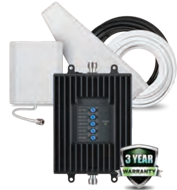
Shown: Fusion Professional signal booster kit