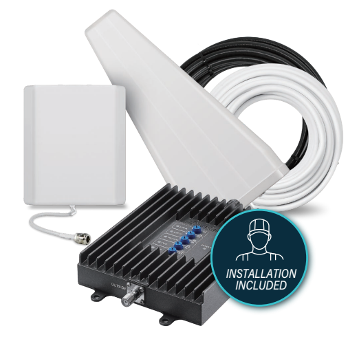
Shown: Fusion Install signal booster kit