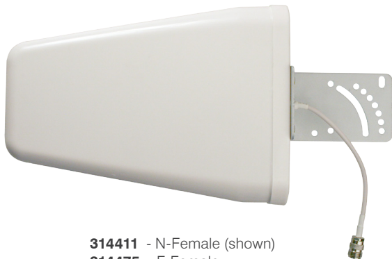
314411 - N-Female (shown) 314475 - F-Female