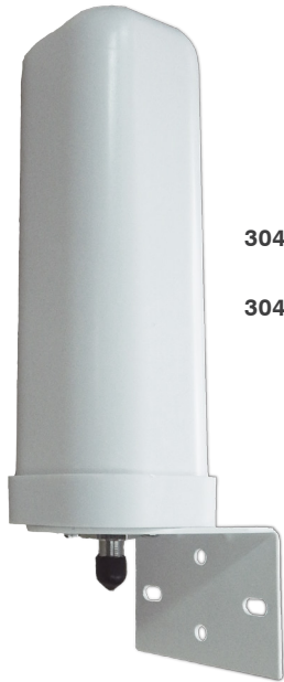
304424 4G Omni Building Antenna (50 ohm)