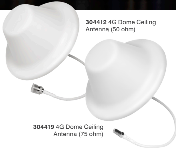
304412 4G Dome Ceiling Antenna (50 ohm)