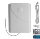
Inside Antenna Upgrade Kit 304447*