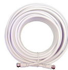
20 ft. White RG6 Low Loss Coax 950620*