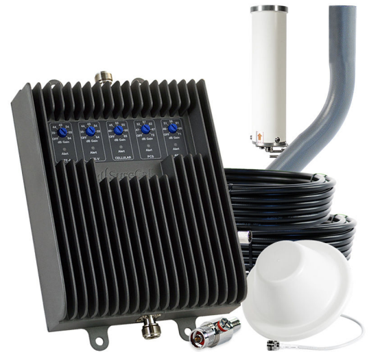
Shown: SureCall Fusion5s omni/dome kit from Powerful Signal