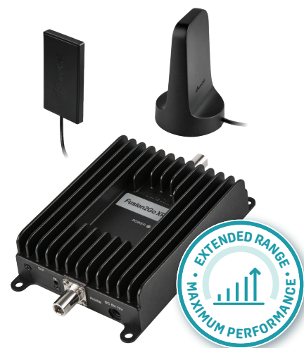
Extended Range for Maximum Performance in Remote Areas