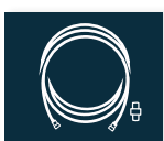
RG-11, 50 ft, optional adaptor