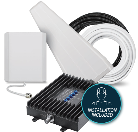
Shown: Fusion Install signal booster kit