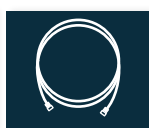
SC-240, 20 ft