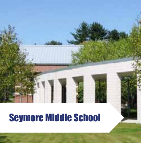
Seymore Middle School