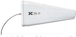
Wideband Directional Antenna