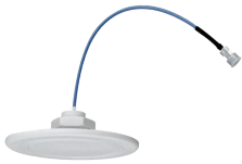
Indoor Low Profile Antenna