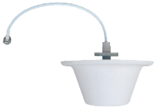
Indoor Omni Antenna